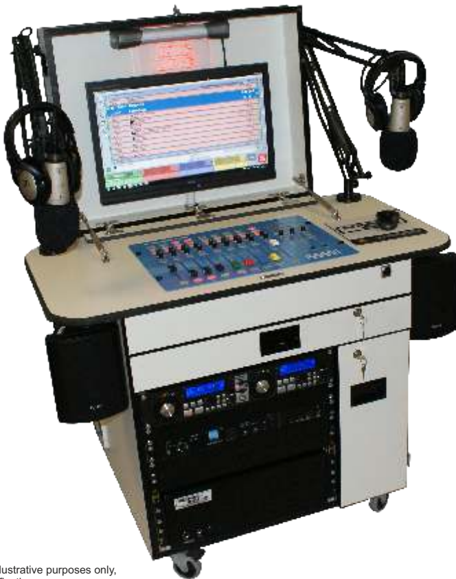
Picture for illustrative purposes only, actual specification may vary.

Perfect for schools with limited space or who want to move the studio between classrooms.