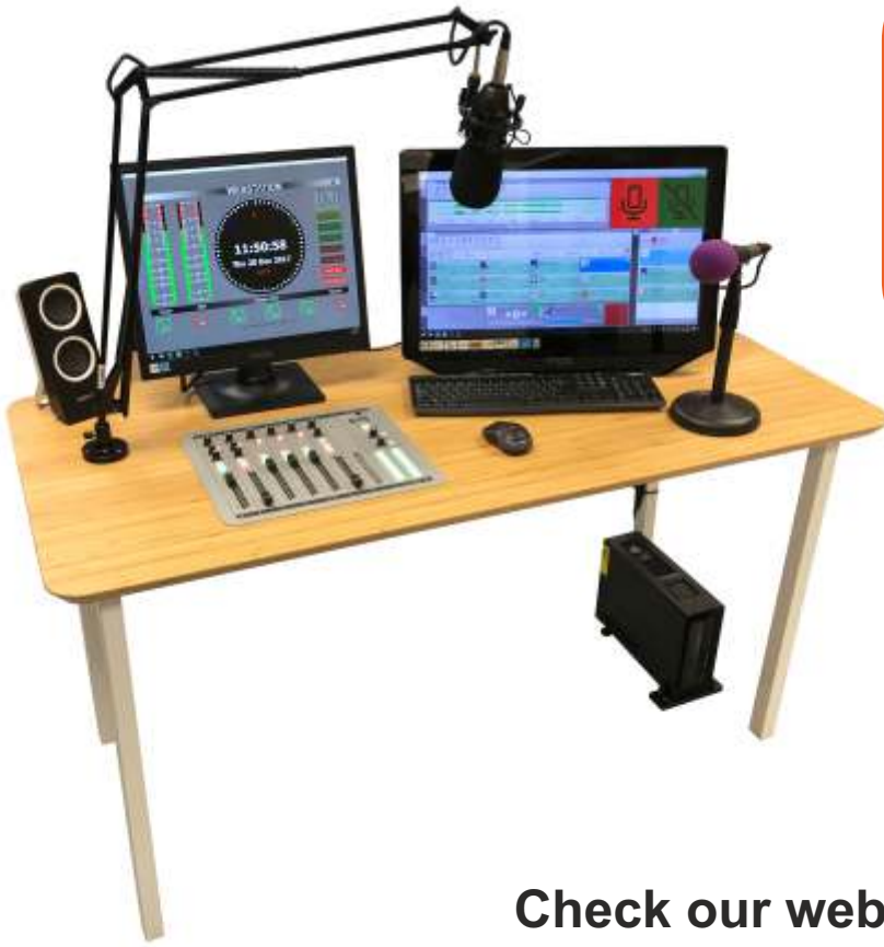
Picture for illustrative purposes only, actual specification may vary.

The Starter + package is based on our original School Radio package but brought bang up to date with the latest technology. Designed as a 'no frills' solution, the Starter + concentrates in the core components to provide the best possible solution at the most accessible price.