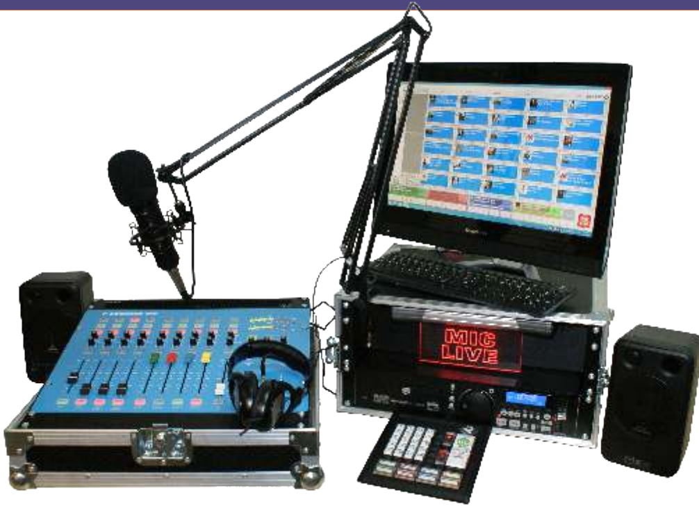
Picture for illustrative purposes only, actual specification may vary.

Portable School Radio studio ideal for schools with multiple sites or for sharing between schools in a cluster.